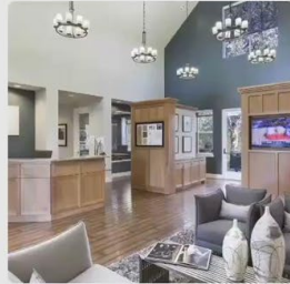
Highlands of Maricopa San Rafael, CA

"I can't express how grateful I am that my building is Airbnb-friendly! Hosting has given me